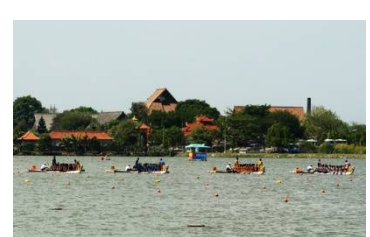
Batur Lake, Location of the 1 st Bali Inter'l Dragon Boat Race & Fes 2016 and place of the 1 st Asian Beach Games in Bali in 2008 (right)

Bali is an island and province of Indonesia. The province includes the island of Bali and a few smaller neighbouring islands, notably Nusa Penida, Nusa Lembongan, and Nusa Ceningan. It is located at the westernmost end of the Lesser Sunda Islands, between Java to the west and Lombok to the east. Its capital of Denpasar is located at the southern part of the island.. Being an original lake it focuses on the concept of a recreational park bringing an image for its uniqueness.