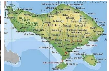
Denpasar City The Biggest city in Bali, Dragon Boat Hotel Accommodation, Ngurah Rai Air Port in Bali, and Bali Map